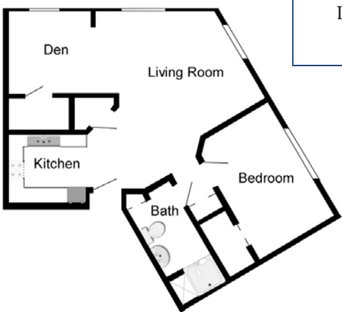
Deluxe Two Bedroom 1,015 square feet